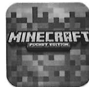
Minecraft 13 years old