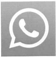
WhatsApp 16 years old