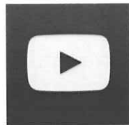
YouTube 13 years old