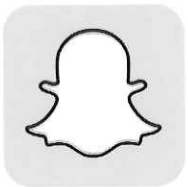
Snapchat 13 years old