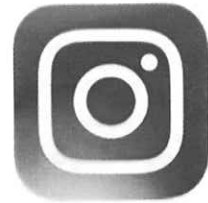
Instagram 13 years old